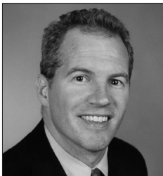
Sen. Geoff Michel